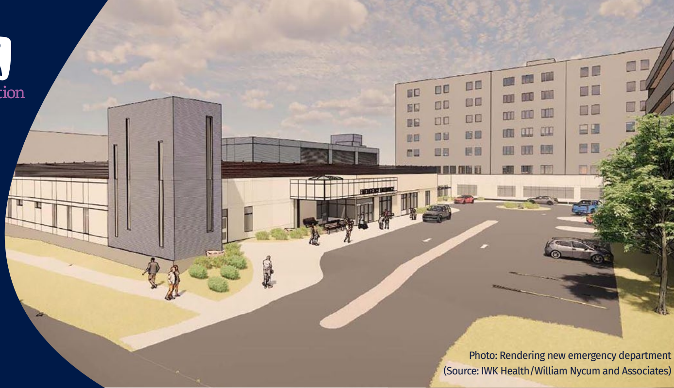
Photo: Rendering new emergency department (Source: IWK Health/William Nycum and Associates)